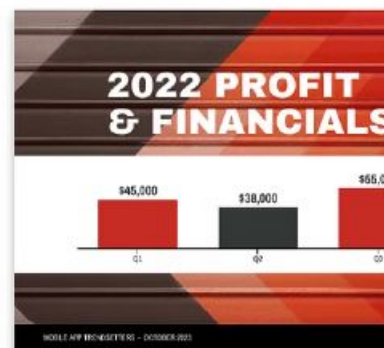
Horizontal Bar Chart