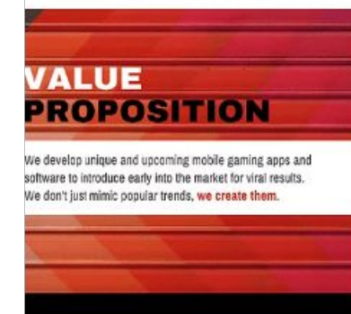
Value Proposition Text & Icon