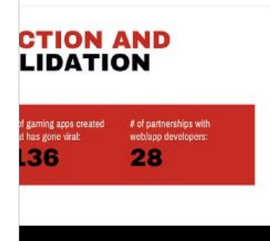
Statistical Text & Icon